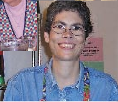
Thanksgiving is a time for family. Everyone at Marian House IS family.