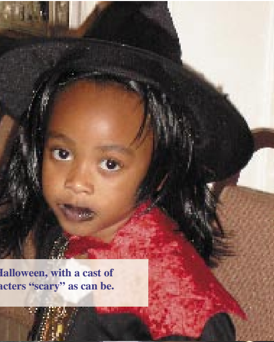
It's Halloween, with a cast of characters "scary" as can be.