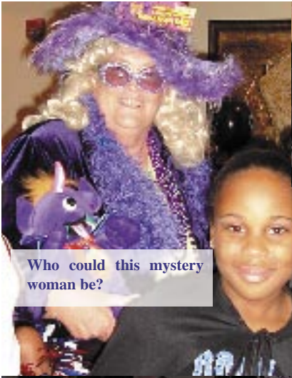
Who could this mystery woman be?