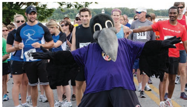
Baltimore Ravens Mascot, Poe, kicks off the Marian House Race to Embrace Independence 5K Run and Walk on September 29, 2012.