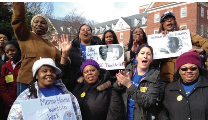
(Above left) Notre Dame of Maryland University February 7, 2013 panel discussion - Mental Illness and Substance Abuse: A Complex Relationship (Above right) Marian House photography exhibit display at the Enoch Pratt Central Library. (Left) Marian House staff and residents at the Homeless and Reentry Lobby Day in Annapolis in February 2013.

others,” she explains. “Marian House seems to be an eternal flame in all of the women that have ever called Marian House home.”