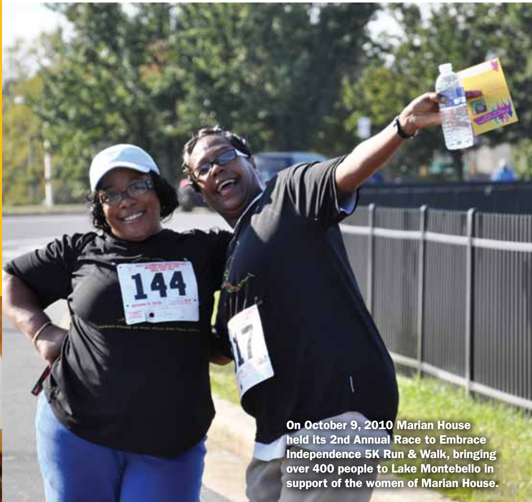
On October 9, 2010 Marian House held its 2nd Annual Race to Embrace Independence 5K Run & Walk, bringing over 400 people to Lake Montebello in support of the women of Marian House.