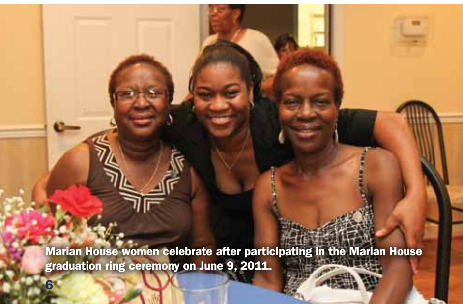
Marian House women celebrate after participating in the Marian House graduation ring ceremony on June 9, 2011.