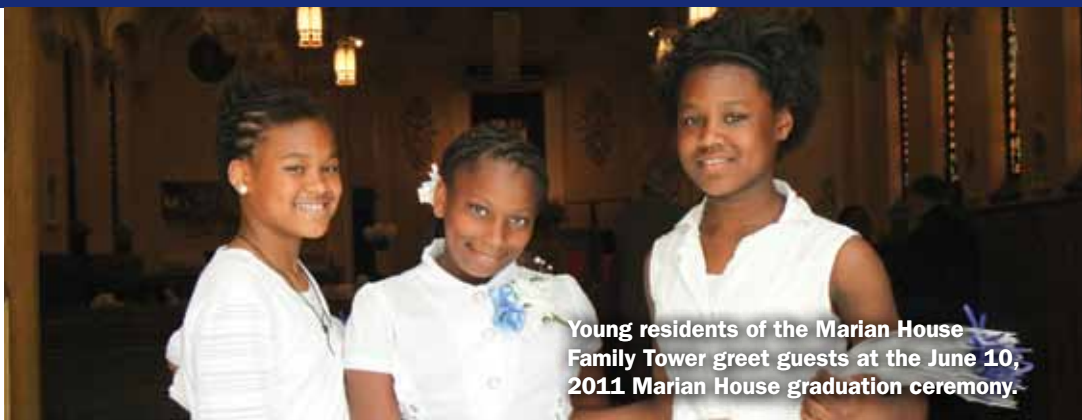
Young residents of the Marian House Family Tower greet guests at the June 10, 2011 Marian House graduation ceremony.