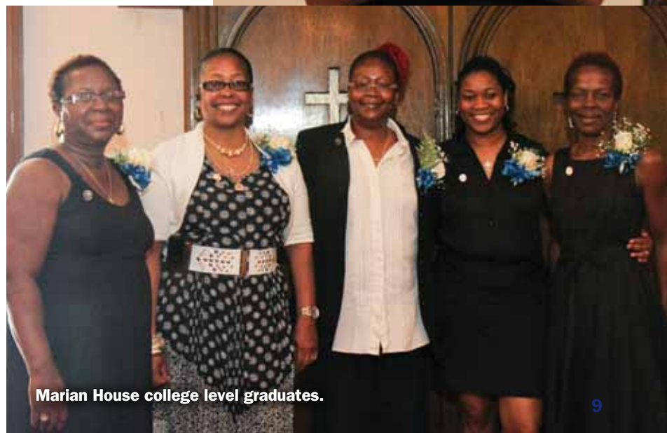
Marian House college level graduates.