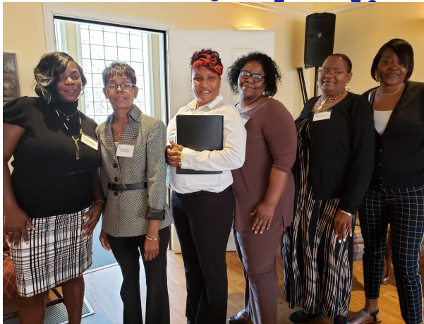
Job Readiness Program graduation