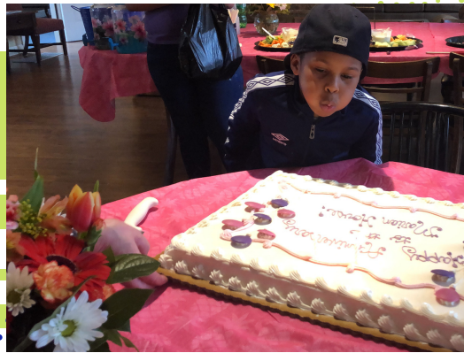
Marian House 37th Anniversary