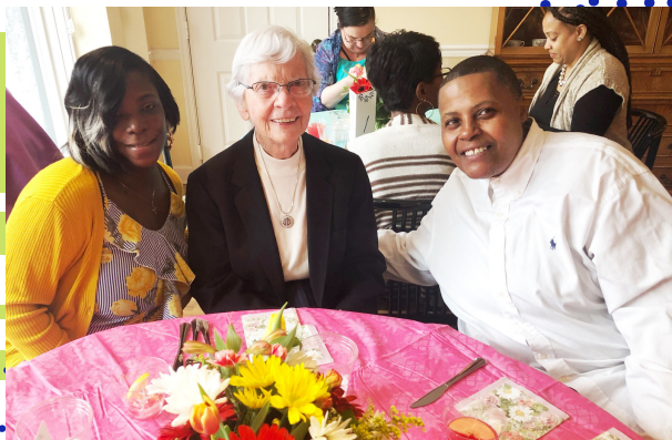
Founders Dinner: Residents and Sisters from SSND and Sisters of Mercy gathered for dinner to celebrate Marian House's 37th Anniversary