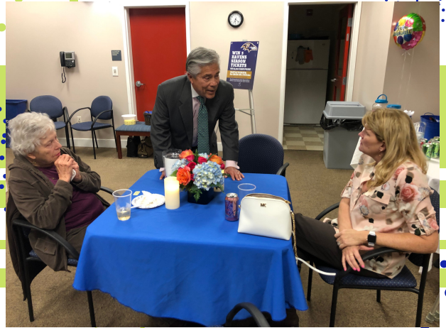
Volunteer Appreciation event